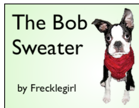
Featured Spot Example (Pattern Ad Shown)

These extremely limited spots feature individual yarns and patterns, and conveniently link directly to the yarn or pattern’s page on Ravelry.