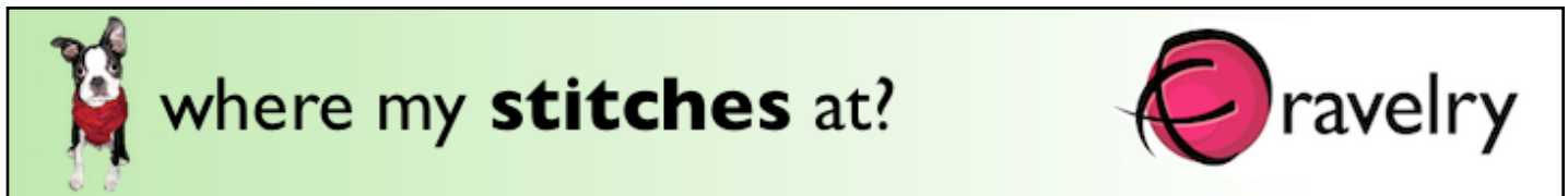
Forums and Group Sponsorship Banner Example

There are six main boards that are pre-loaded on every member’s forum page. Together, these boards: Patterns , Yarn , Techniques , For the Love of Ravelry , Needlework on the Net , and Remnants , account for over half the forum traffic on Ravelry. At the bottom of every page of every forum discussion thread, we have a banner-shaped ad unit, visible to everyone as they read through the posts. Each page of every discussion in these six boards will have one banner placed just below the last post and right above the forum navigation controls – the only ad on the page. We allow a maximum of 125 advertisers in this spot each month.